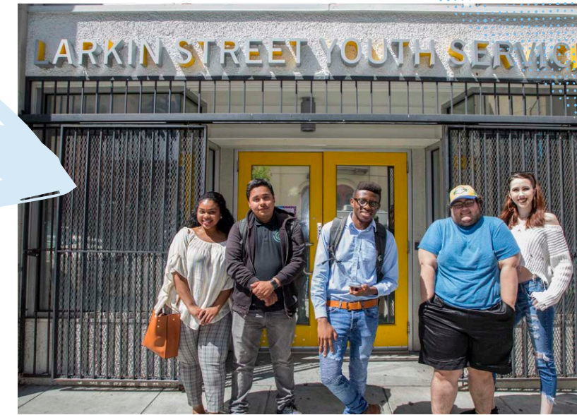
Foundation community partner Larkin Street Youth Services empowers young people to move beyond homelessness by connecting them to a spectrum of mental health and wellness services.

More than 1,100 individuals experiencing emotional or psychological distress rely on Saint Francis annually for mental health care. Every May during national Mental Health Awareness Month, the Foundation helps increase awareness, fight stigma and raise funds to support the Hospital's and the community's response to patients' behavioral and mental health and substance use challenges. In 2021, the Foundation allocated $860,000 in community grants to Larkin Street Youth Services, Curry Senior Center, San Francisco Community Health Center, and the Mental Health Association of San Francisco to help build a continuum of quality mental health care once patients leave the Hospital.